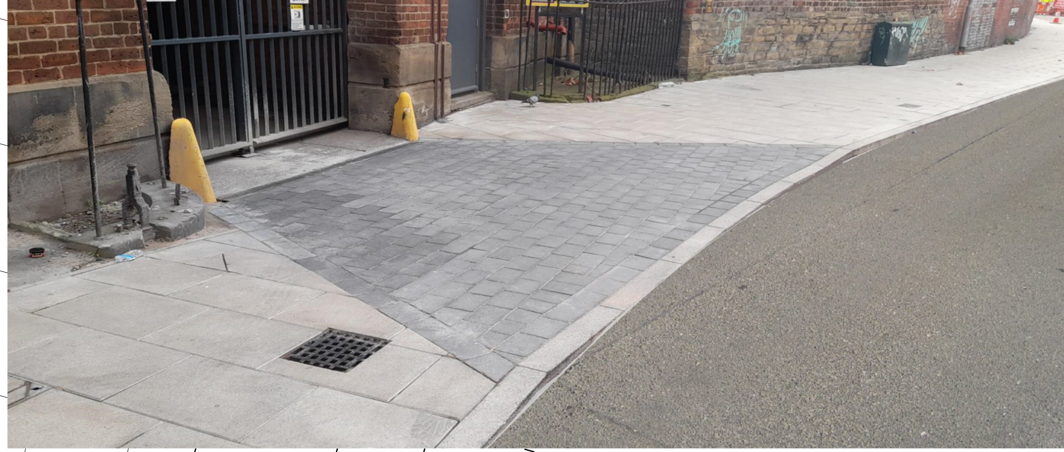
PROPOSED SIDE ROAD / ACCESS TREATMENT